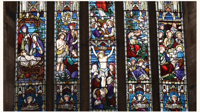
East window detail showing scenes in the life of Christ